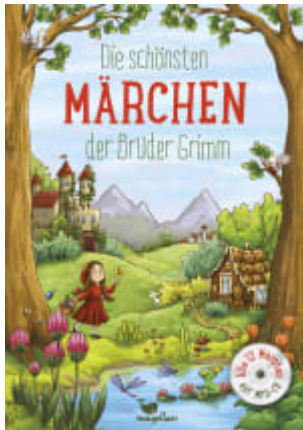
Die schönsten Märchen der Brüder Grimm, mit MP3-CD