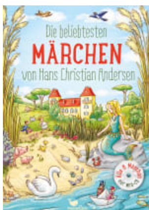
Die beliebtesten Märchen von Hans Christian Andersen, mit MP3-CD