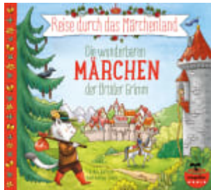
Reise durch das Märchenland - Die wunderbaren Märchen der Brüder Grimm (Audio-CD)