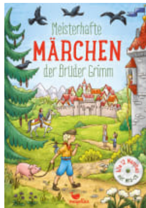
Meisterhafte Märchen der Brüder Grimm, mit MP3-CD