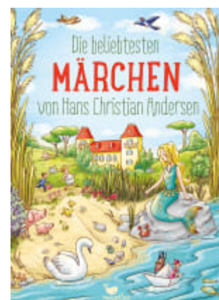
Die beliebtesten Märchen von Hans Christian Andersen