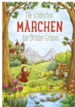
Die schönsten Märchen der Brüder Grimm