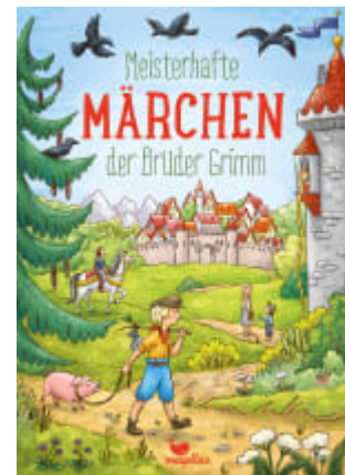
Meisterhafte Märchen der Brüder Grimm