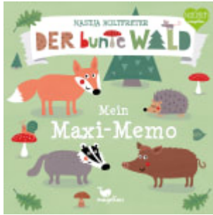
Der bunte Wald - Mein Maxi-Memo