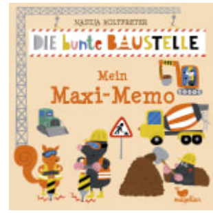
Die bunte Baustelle - Mein Maxi-Memo