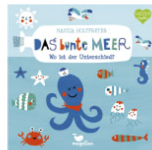
Das bunte Meer - Wo ist der Unterschied?