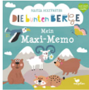
Die bunten Berge - Mein Maxi-Memo