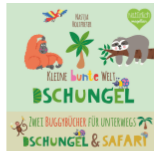
Kleine bunte Welt - Dschungel & Safari