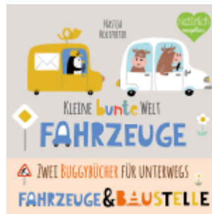
Kleine bunte Welt - Fahrzeuge & Baustelle