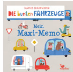
Die bunten Fahrzeuge - Mein Maxi-Memo