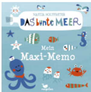
Das bunte Meer - Mein Maxi- Memo