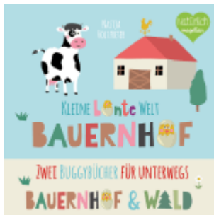
Kleine bunte Welt - Bauernhof & Wald