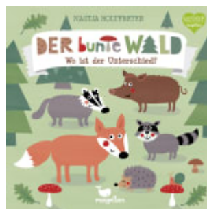
Der bunte Wald - Wo ist der Unterschied?