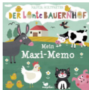
Der bunte Bauernhof - Mein Maxi-Memo