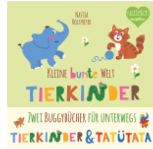
Kleine bunte Welt - Tierkinder & Tatütata