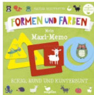
Eckig, rund und kunterbunt - Mein Maxi-Memo - Formen und Farben