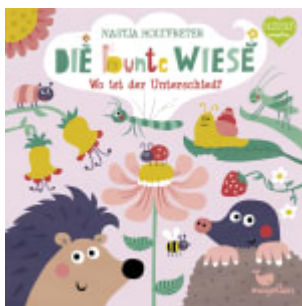
Die bunte Wiese - Wo ist der Unterschied?