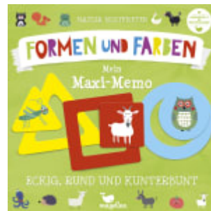
Eckig, rund und kunterbunt - Mein Maxi-Memo - Formen und Farben