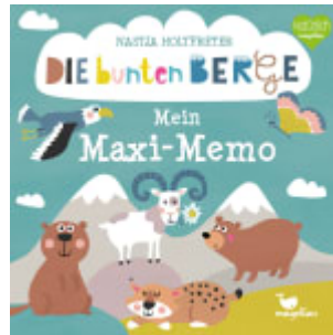
Die bunten Berge - Mein Maxi-Memo