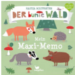
Der bunte Wald - Mein Maxi-Memo