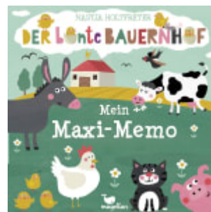
Der bunte Bauernhof - Mein Maxi-Memo