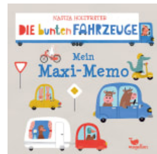
Die bunten Fahrzeuge - Mein Maxi-Memo