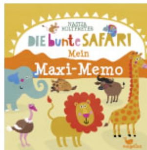
Die bunte Safari - Mein Maxi-Memo