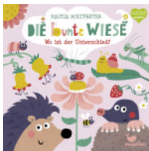
Die bunte Wiese - Wo ist der Unterschied?