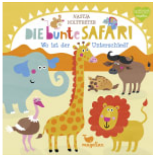
Die bunte Safari - Wo ist der Unterschied?