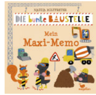
Die bunte Baustelle - Mein Maxi-Memo