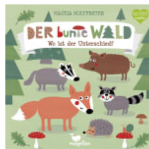
Der bunte Wald - Wo ist der Unterschied?