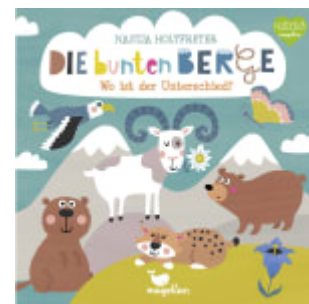
Die bunten Berge - Wo ist der Unterschied?