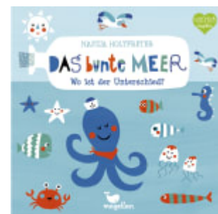
Das bunte Meer - Wo ist der Unterschied?