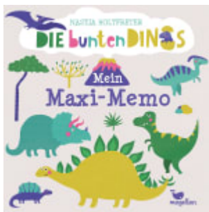
Die bunten Dinos - Mein Maxi-Memo