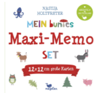
Mein buntes Maxi-Memo-Set