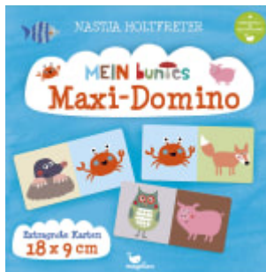
Mein buntes Maxi-Domino