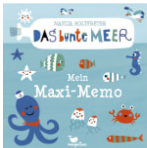
Das bunte Meer - Mein Maxi- Memo