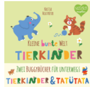
Kleine bunte Welt - Tierkinder & Tatütata