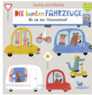
Die bunten Fahrzeuge - Wo ist der Unterschied?