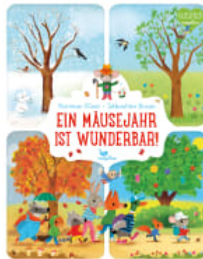
Ein Mäusejahr ist wunderbar!