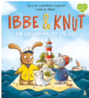
Ibbe & Knut - Ein Seehund macht Urlaub (Volume 2)