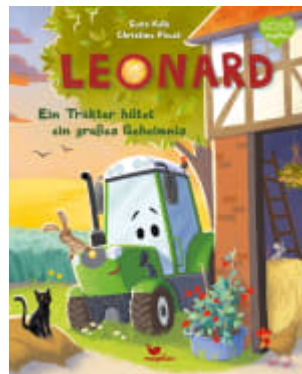
Leonard - Ein Traktor hütet ein großes Geheimnis (Volume 2)