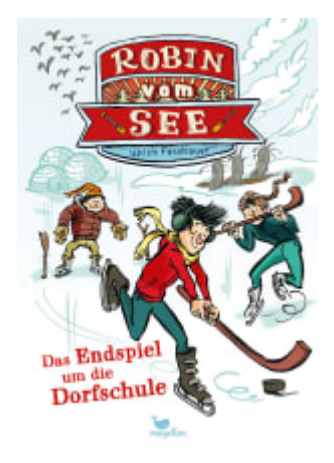
Robin vom See - Das Endspiel um die Dorfschule (Volume 4)