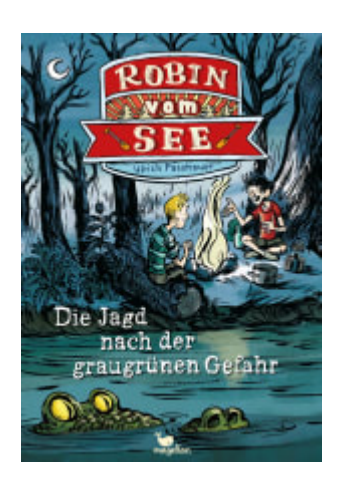
Robin vom See - Die Jagd nach der graugrünen Gefahr (Volume 2)