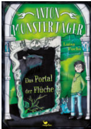
Anton Monsterjäger - Das Portal der Flüche (Volume 2)