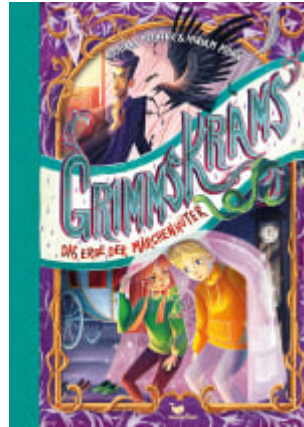
Grimmskrams - Das Erbe der Märchenhüter (Volume 3)