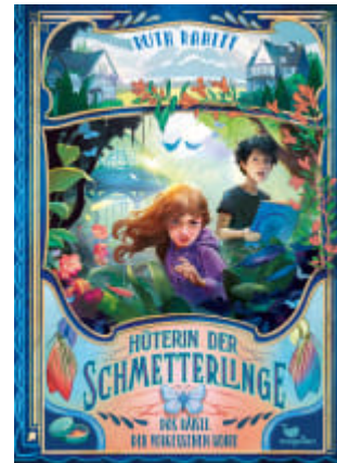
Hüterin der Schmetterlinge - Das Rätsel der vergessenen Worte (Volume 4)