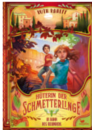
Hüterin der Schmetterlinge - Im Bann des Oleanders (Volume 3)