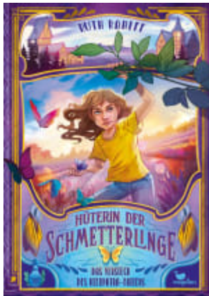
Hüterin der Schmetterlinge - Das Versteck des Kleopatra- Falters (Volume 1)