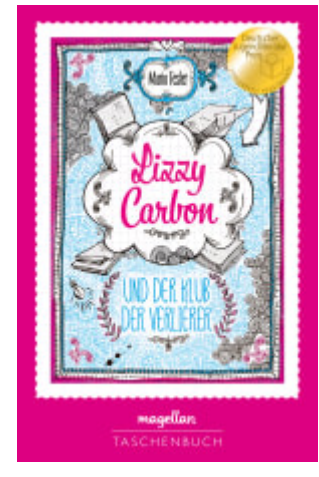
Lizzy Carbon und der Klub der Verlierer (Volume 10000)