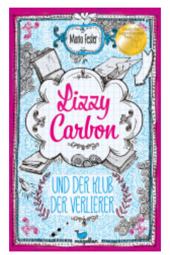
Lizzy Carbon und der Klub der Verlierer (Volume 1)