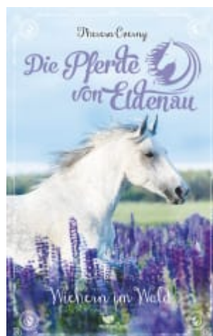
Die Pferde von Eldenau - Wiehern im Wald (Volume 4)