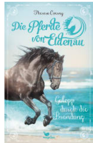
Die Pferde von Eldenau - Galopp durch die Brandung (Volume 2)