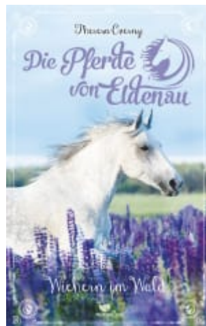
Die Pferde von Eldenau - Wiehern im Wald (Volume 4)