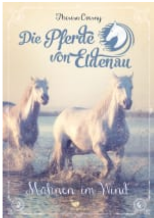
Die Pferde von Eldenau - Mähnen im Wind (Volume 1)