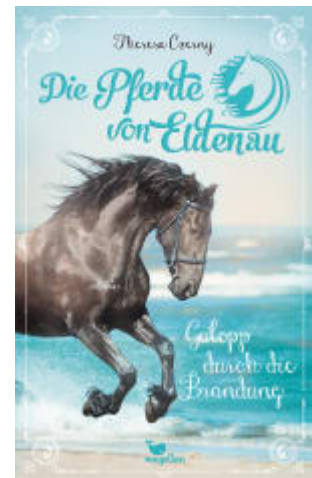
Die Pferde von Eldenau - Galopp durch die Brandung (Volume 2)